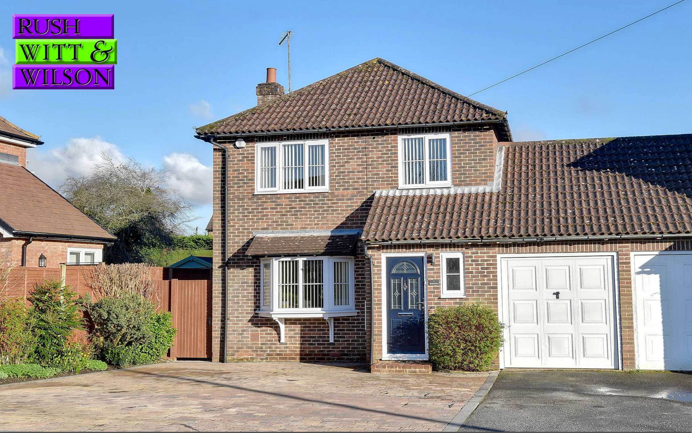
1 Orchard View Shrubcote, Tenterden, Kent TN30 7BW Offers In The Region Of £535,000